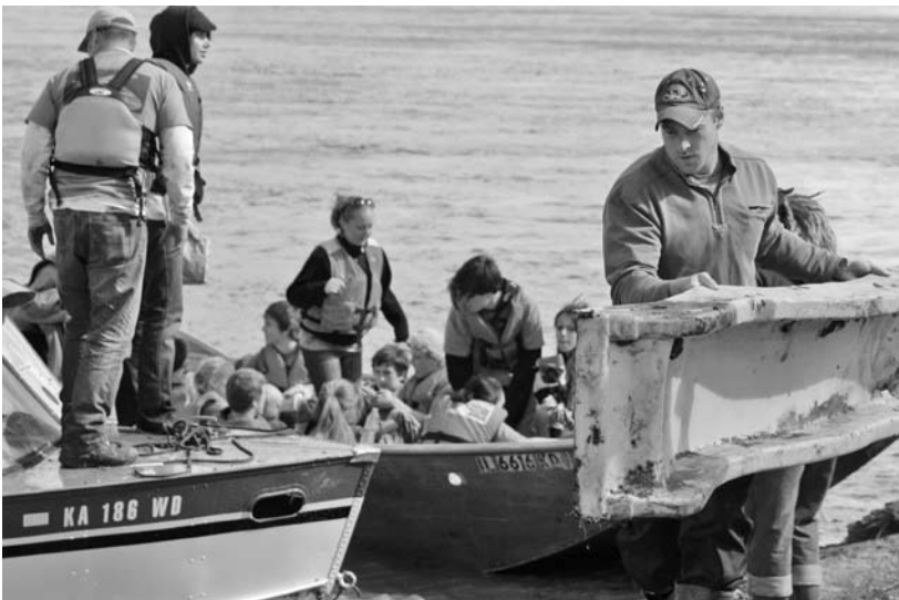
Above: As soon as the first volunteers return for lunch, the first trash begins to be unloaded.